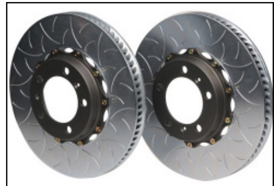
360 Challenge Stradale replacement iron rotors 380/350mm